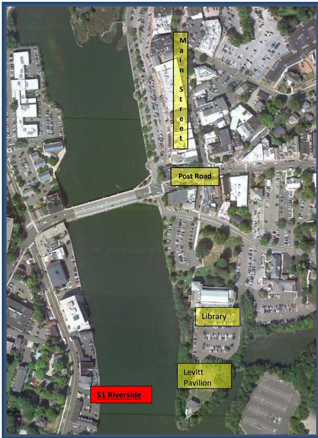
51 Riverside Avenue, Westport, CT