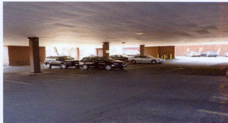
Ample Covered Parking