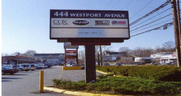
Pylon Sign on US-1