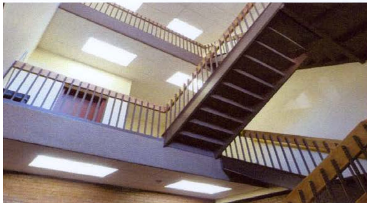
Three-story high lobby