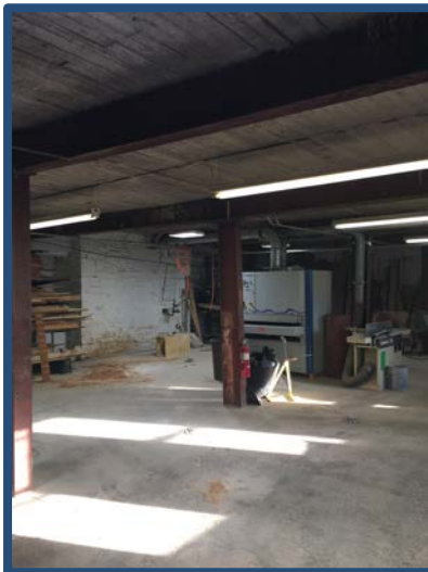
Lower level on grade