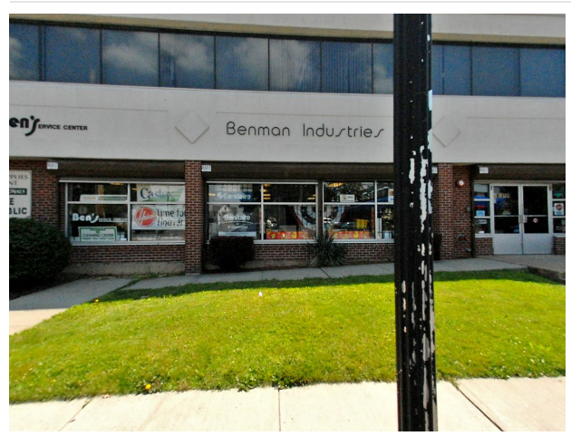
(http://images.vgsi.com/photos2/BridgeportCTPhotos//\\ \00\\ \08\\ \06