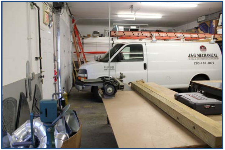
All information from sources deemed reliable and is submitted subject to errors, omissions, change of price, rental, and property sale and withdrawal notice.