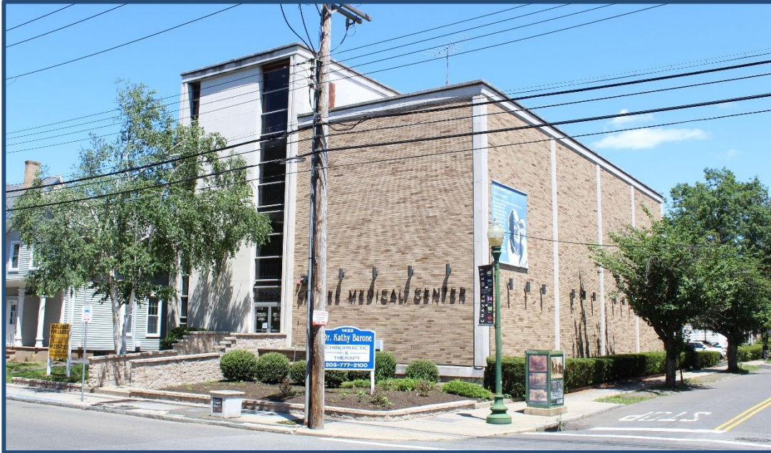
Chapel Medical Center