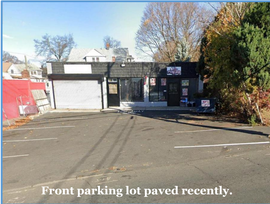
Front parking lot paved recently.

Fully Leased- Month to Month Below Market Value