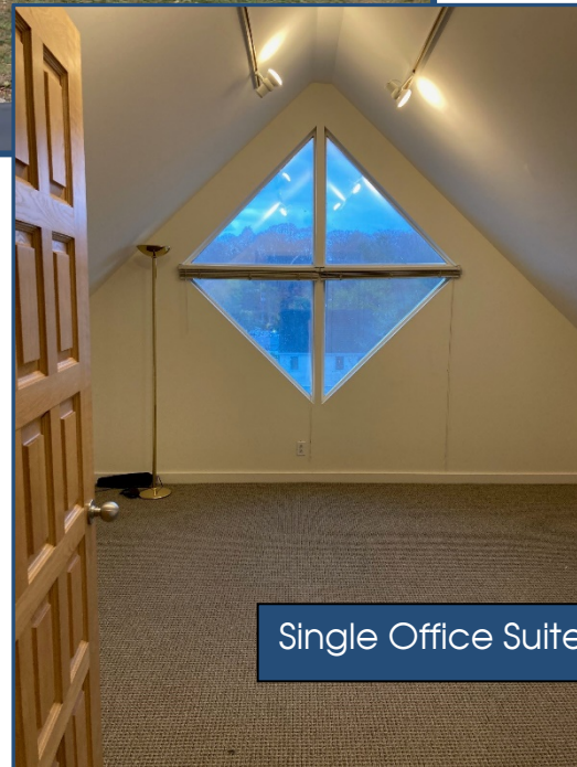
Single Office Suite

Light bright space - Renovated lobby Elevated building - Ample on-site parking Convenient to Downtown and Metro North Train Station.